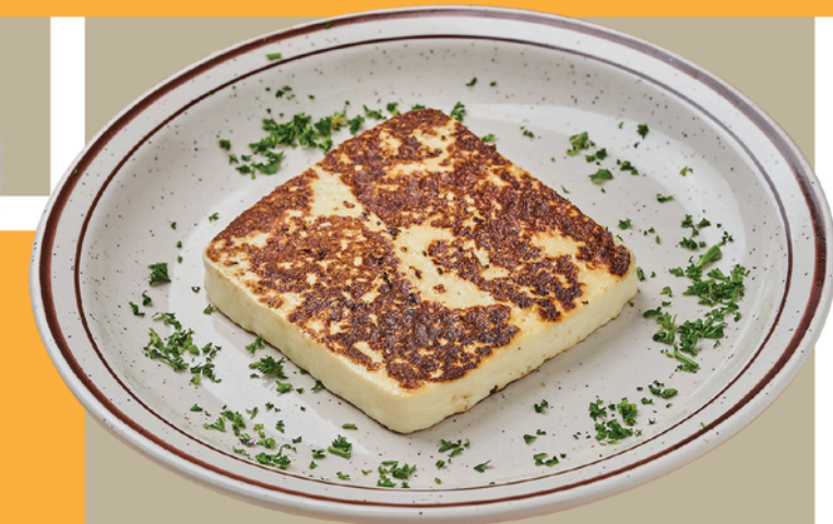
GRIDDLED CHEESE - $8.50 Fresh white cheese seared on the grill with a golden crust.