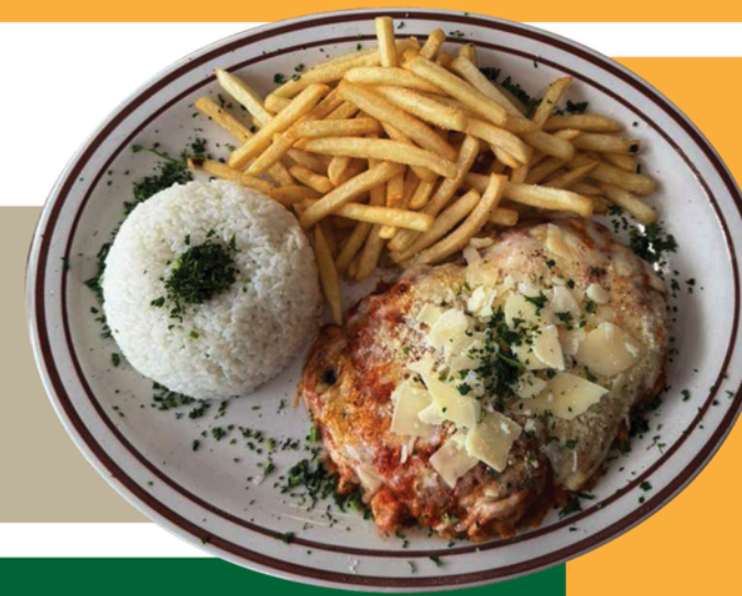
MILANESA DE POLLO A LA PARMESANA - $23 Crispy chicken breast with homemade marinara sauce, topped with mozzarella and parmesan cheese, served with two sides of your choicesides.

* A service charge will be added to the final invoice for parties of 6 or more.