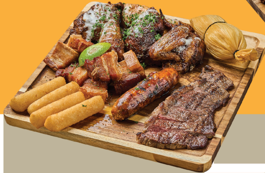
MIXED GRILL (FOR 2) - $58.99 8 oz picanha, 1/2 roasted chicken, pork chicharrón, sausage and two sides .