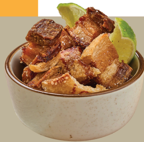
CHICHARRONES - $11.50 Crispy fried pork bites. Served with salt and lime, a classic full of flavor, tradition, and character.