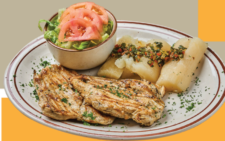
GRILLED CHICKEN BREAST - $17 Marinated chicken breast grilled to perfection and two sides .