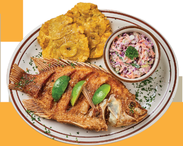
FRIED MOJARRA - $21.50 Whole mojarra seasoned and fried to order and two sides .