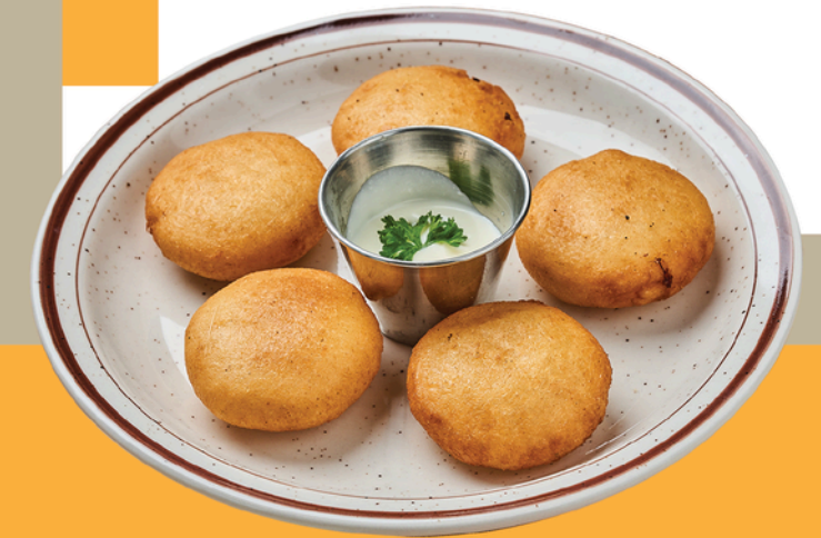
AREPITAS WITH CREAM - $9.99 Handmade white corn mini arepas filled with fresh cheese and served with cream, (5 units).