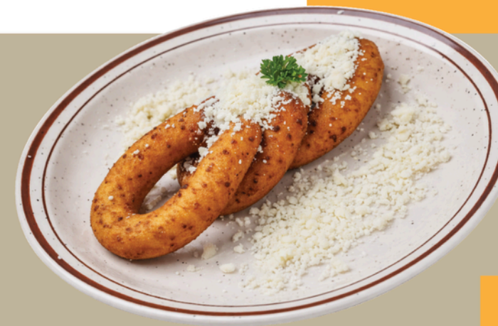
MANDOCAS - $10 Traditional doughnuts made with ripe plantain, anise, white cornmeal, and cane sugar, served with fresh cheese and cream. (3 units).