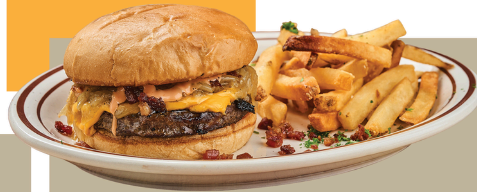
BEEF BURGER - $18 Juicy beef, caramelized onions, cheddar, bacon and pink sauce.