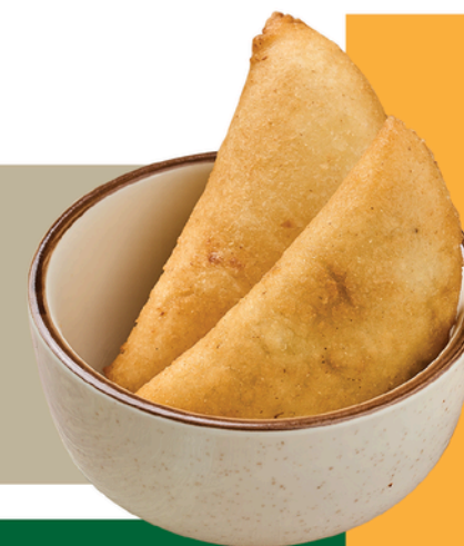
EMPANADAS $2.99 Handmade white corn empanadas filled with cheese, shredded beef, ground beef or chicken.

* A service charge will be added to the final invoice for parties of 6 or more.