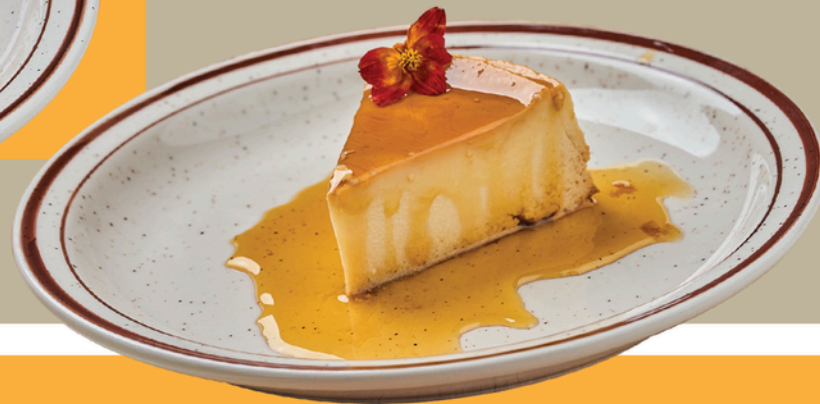
FLAN (Quesillo) - $10.