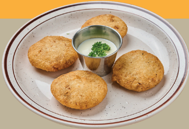
CRISPY PORK AREPITAS - $12.99 Handmade white corn mini arepas filled with crispy pork chicharrón, (4 Units).