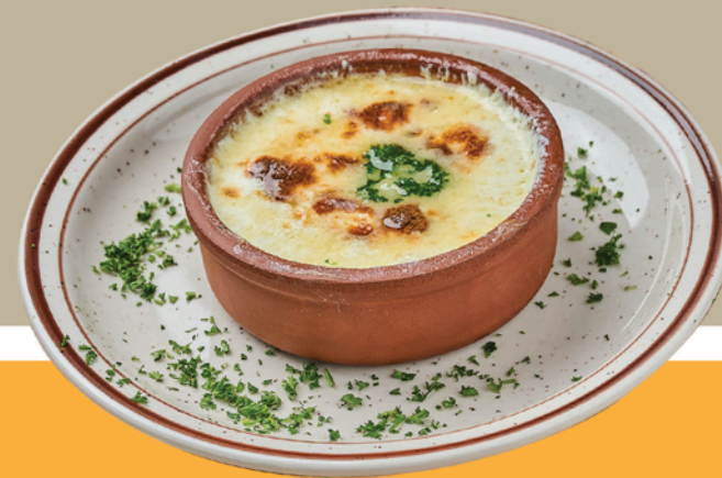
GRILLED TELITA CHEESE - $12 Fresh telita cheese slowly grilled.