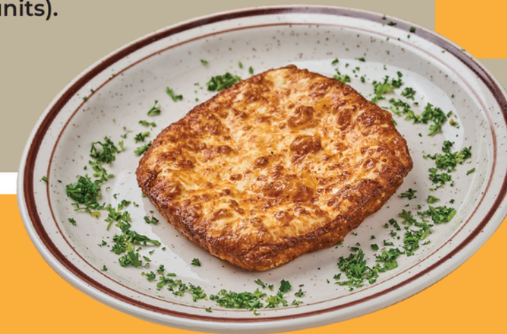
FRIED CHEESE - $8.50 Crunchy outside, soft inside.