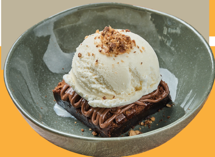
BROWNIE WITH ICE CREAM - $12