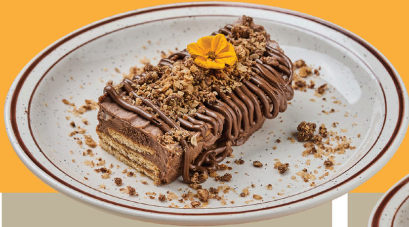
MARQUESA - $12 (Chocolate Cake)