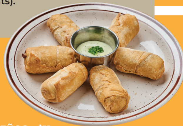
TEQUEÑOS - $11 Golden and crispy dough filled with soft white cheese. Served with our cilantro sauce, (6 units).