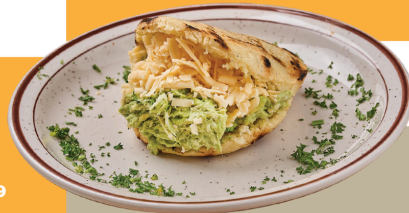
REINA PEPIADA - $12.99 (Chicken & Avocado) Extra yellow cheese.