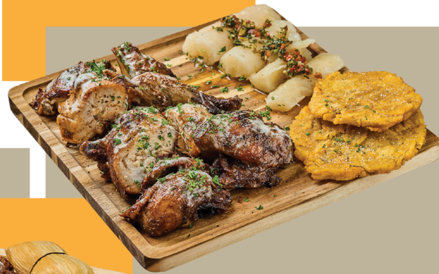
WHOLE ROASTED CHICKEN - $29.99 1/2 chicken $17 • 1/4 chicken $14 Marinated 24 hours with spices and slow-roasted and two sides .