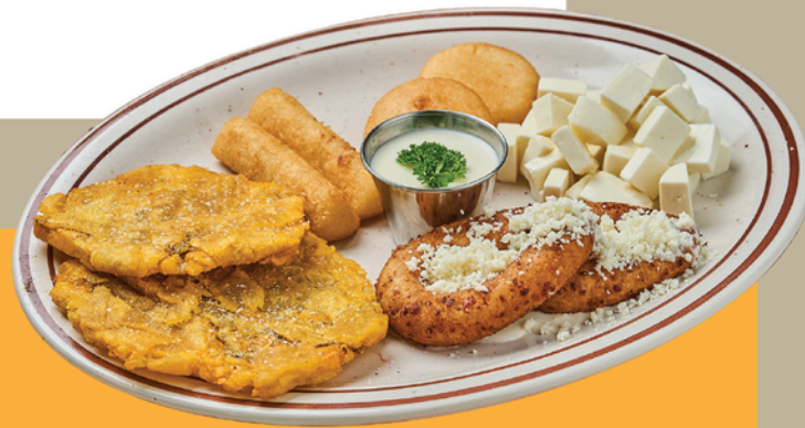
APAMATE SAMPLER - $18.99 2 mandocas, 2 tostones, 2 fried arepitas, 2 fried yuca, fresh cheese and cream.