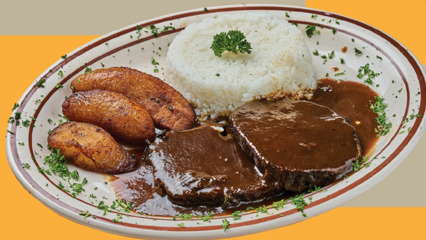
ASADO NEGRO - $19 Slow-cooked round beef in dark caramelized sauce and two sides .