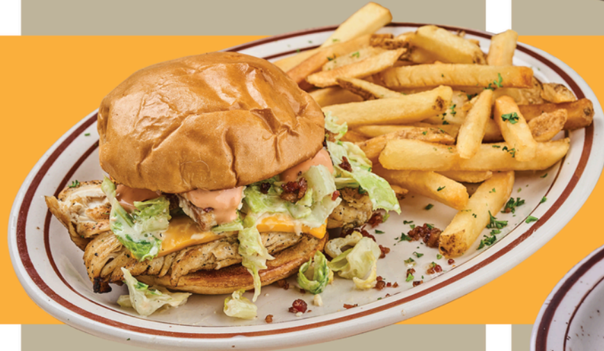
CHICKEN SANDWICH - $17 Brioche bun with roasted chicken, Caesar salad, bacon, and cheddar.