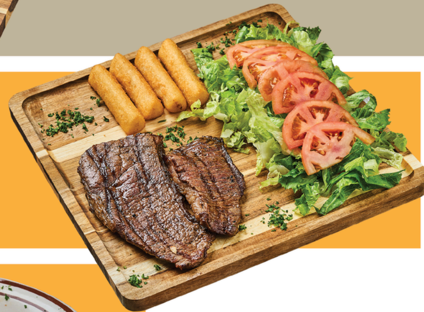
PICANHA - $28.99 12 oz picanha grilled to taste and two sides .