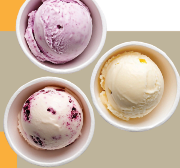
ICE CREAM SCOOP - $4