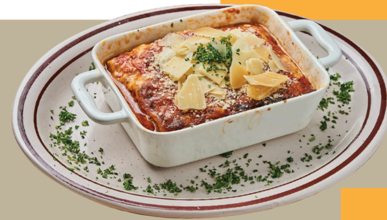
PASTICCIO (LASAGNA) - $18.50 Homemade bolognese lasagna with béchamel, mozzarella, and parmesan.