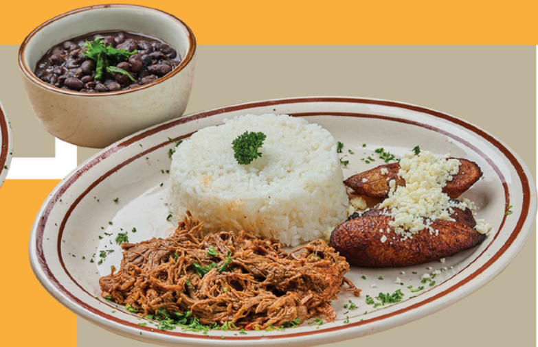
PABELLÓN CRIOLLO - $19 Shredded beef, black beans, sweet plantain, and white rice.