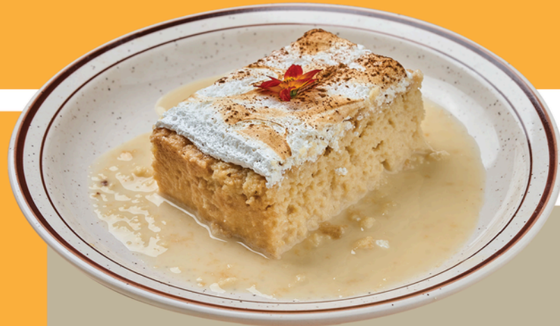
TRES LECHEs - $12