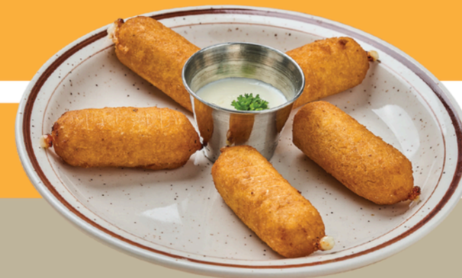
CORN TEQUEÑOS - $11 Crispy corn dough filled with fresh soft cheese, (5 Units).