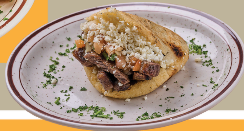
BEEF - $15.99 Pico de Gallo & Shredded White Cheese.